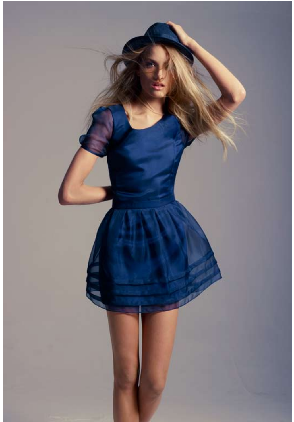
DR12 LA ROBE DE SARANNE